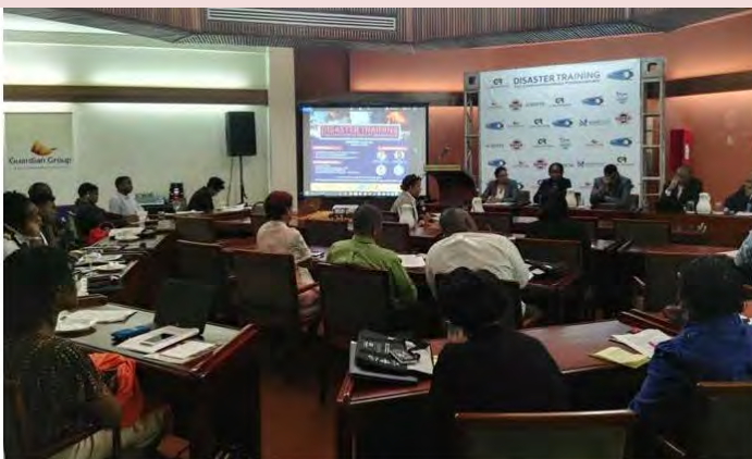
Journalists and communications professionals listening keenly to the panel members consisting of the major utilities and telecommunications companies.

ember 6, 2017. The company will be partnering with international dancehall reggae artiste, Orville Richard 'Shaggy' Burrell for his biennial charity concert which seeks to raise funds to donate well needed equipment and supplies to the hospital, the only Children's hospital in the English-speaking Caribbean.