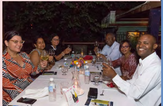
Members of the GGJ Executive and Management Teams at Redbones Blues Café having dinner on the opening night of Restaurant Week 2017

GGJ kicked off the opening night with a dinner for their executive and management team at Redbones Blues