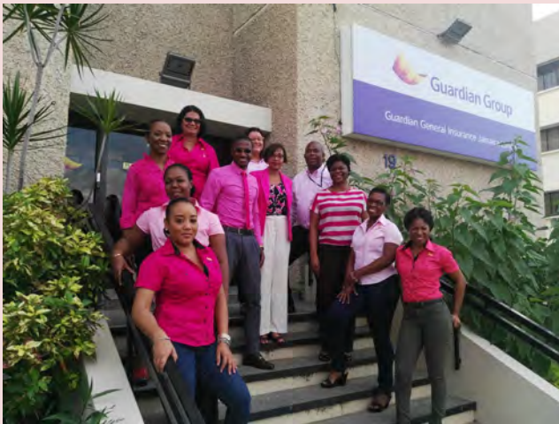
The GGJ team outside their doors at 19 Dominica Drive, Kingston 5