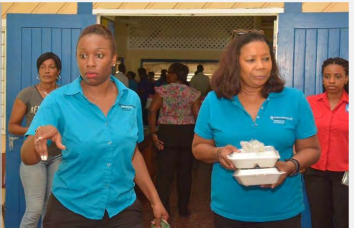
Treating 100 residents of the Bellevue Hospital to a full meal and care.