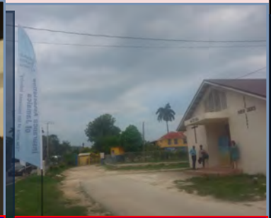
IAJ Banner at the entrance to FSC Town Hall Meeting in Lucea— May 30, 2018